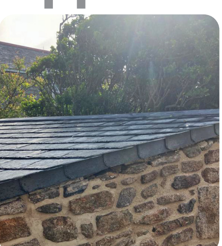
Indistinguishable from a traditionally laid slate roof